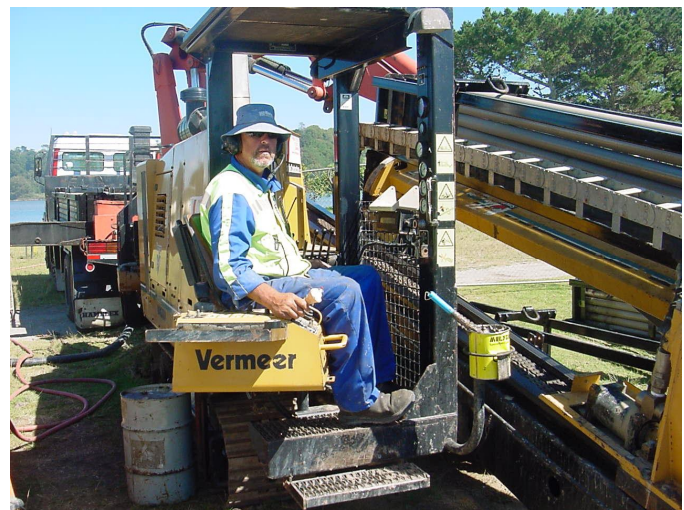
▲ Ice creams for the crew during the pull back

In order to reduce the likely-hood of drill cuttings blowing out through the estuary floor, the bore was planned to be 6-7m deep. This extra depth aided in the return of the drill cuttings to either side of the estuary over the 340m crossing.