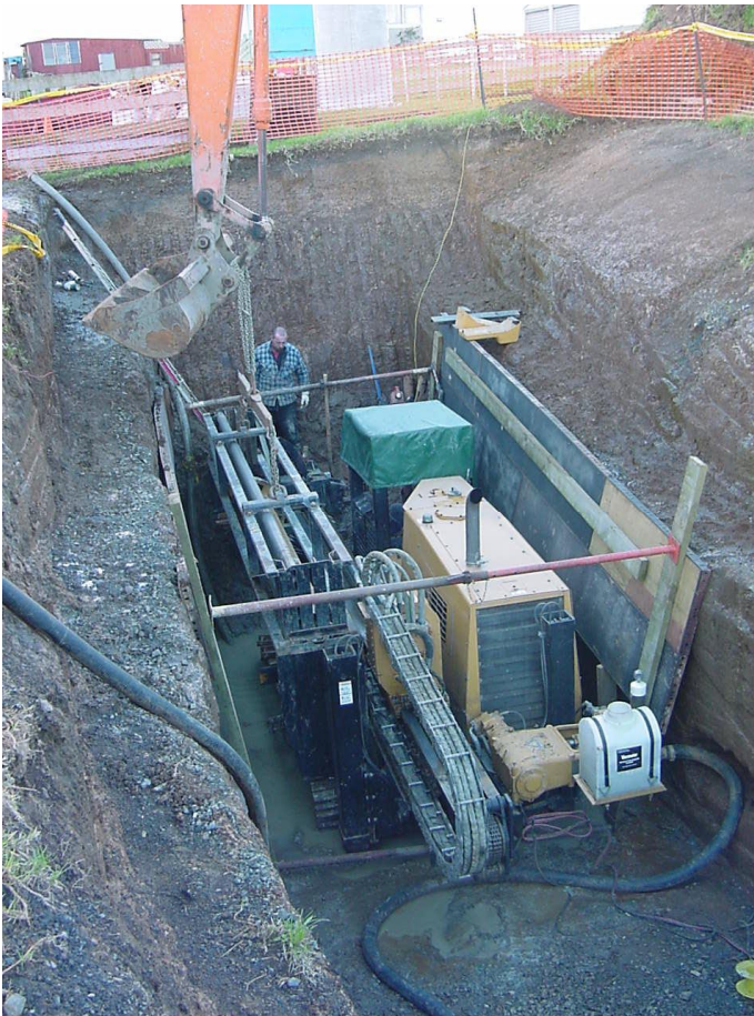
Vermeer drill set on line & grade & drilling 592m sewer continuous

Smythe Contractors successful alternative tender to drill 80m of 1% Micro tunnel and then continue on with a 512m drill at 2% set a New Zealand direction drill and micro-tunnel record.